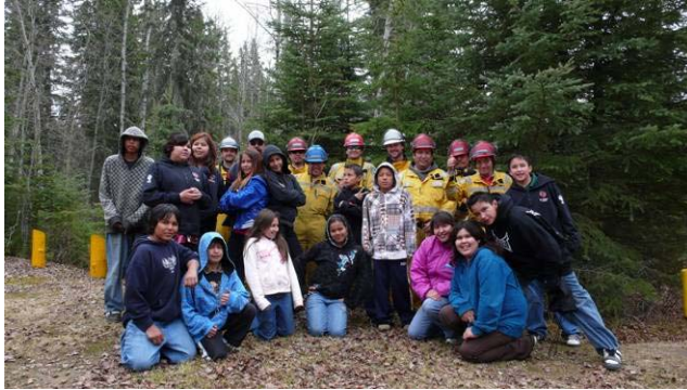
16 forestry school tours with 340 Grade 6 students learning about forestry

To promote forest education and public awareness with special event programming throughout the year.