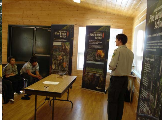
Focus on Forestry Careers saw 13 classes for a total of 292 students