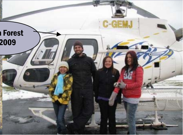
During Alberta Forest Week, Fish and Wildlife Officers talked to 300 students about being Bear Smart!