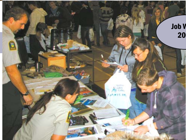
Job World 2008