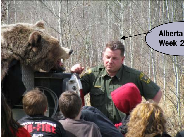
Alberta Forest Week 2009

To promote forest education and public awareness with special event programming throughout the year.